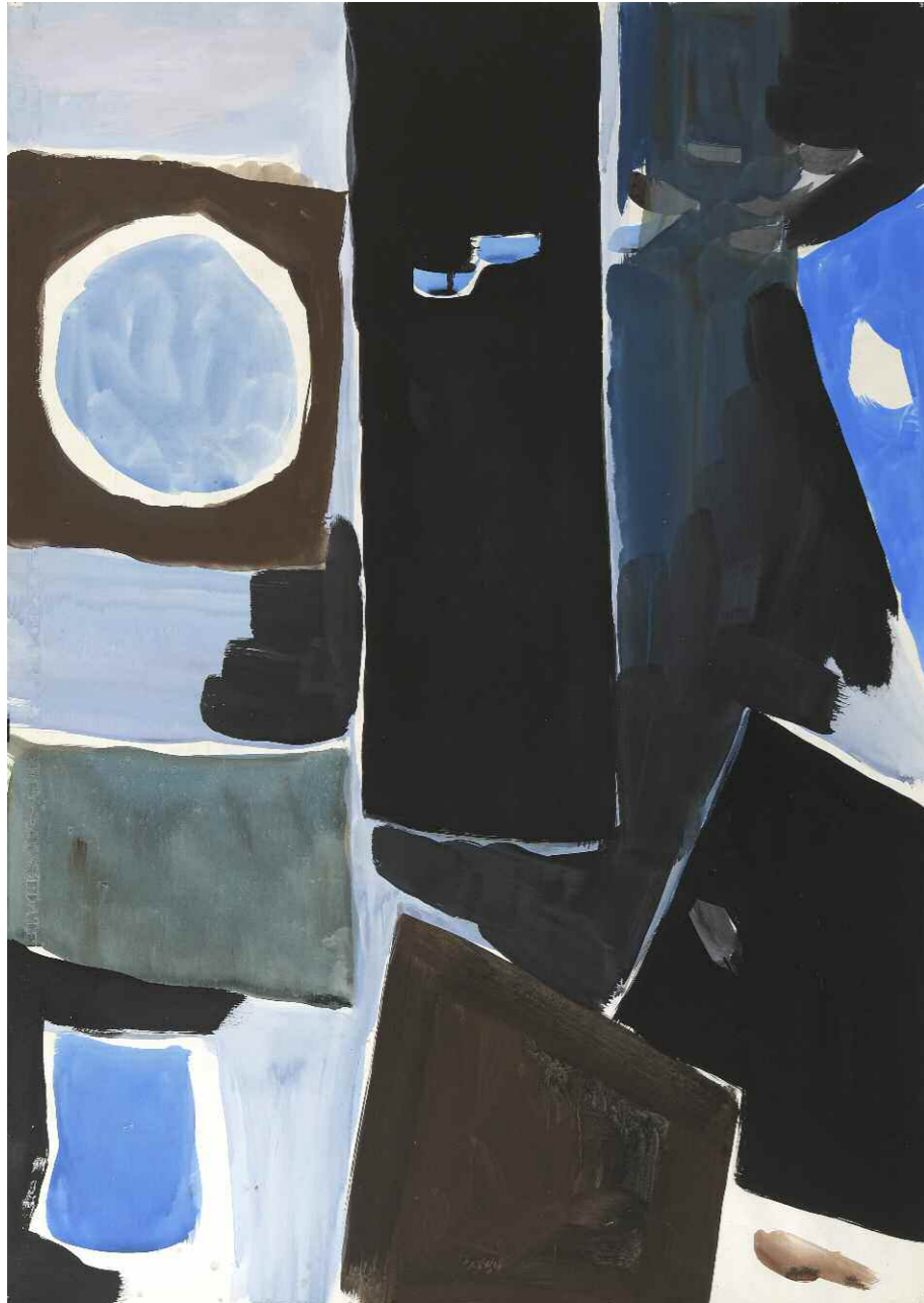
1 Sans titre, circa 1955 Gouache on paper laid on canvas 108 x 75 cm / 42 x 29 in