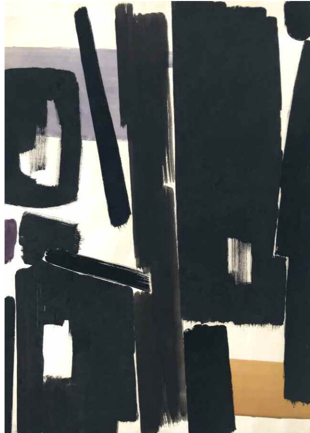
9 Sans titre, circa 1960 Gouache on paper 108 x 75 cm / 42 x 29 in