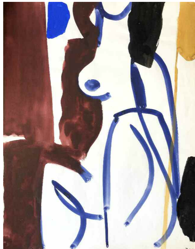
20 Sans titre, circa 1970 Gouache on paper 65 x 50 cm / 25.5 x 20 in