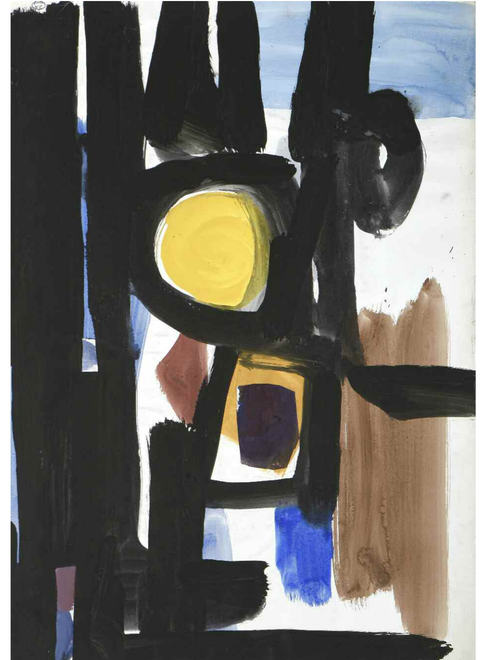
10 Sans titre, circa 1960 Gouache and collage on paper 108 x 75 cm / 42 x 29 in