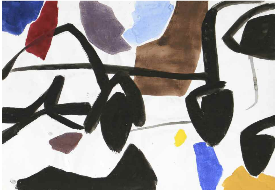
16 Sans titre, circa 1958/60 Gouache on paper 75 x 108 cm / 29 x 42 in