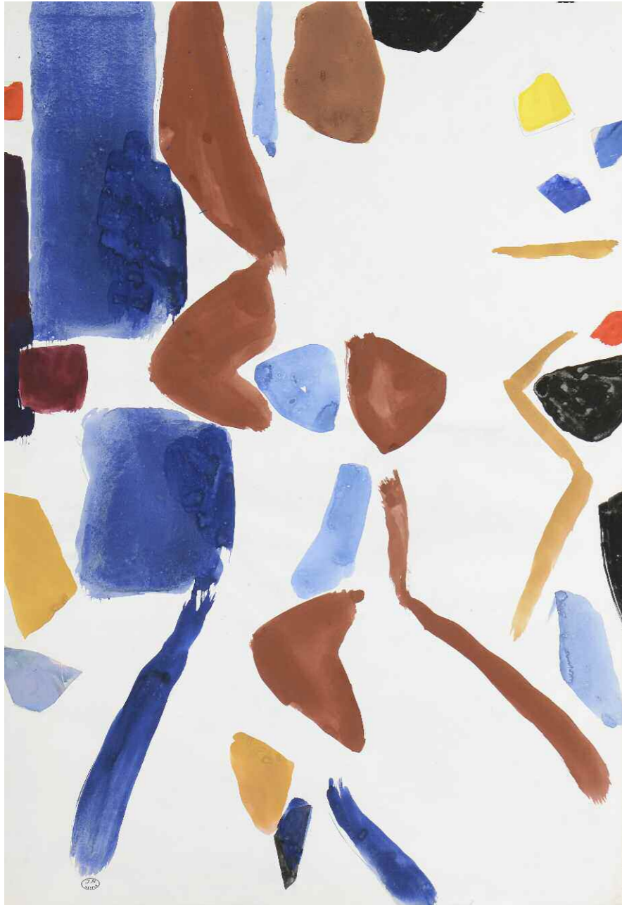
14 Sans titre, circa 1955/60 Gouache and collage on paper 108 x 75 cm / 42 x 29 in