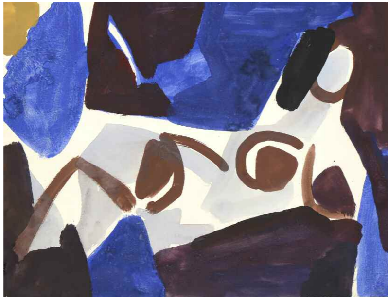
17 Sans titre, circa 1955/60 Gouache on paper 50 x 65 cm / 20 x 25.5 in