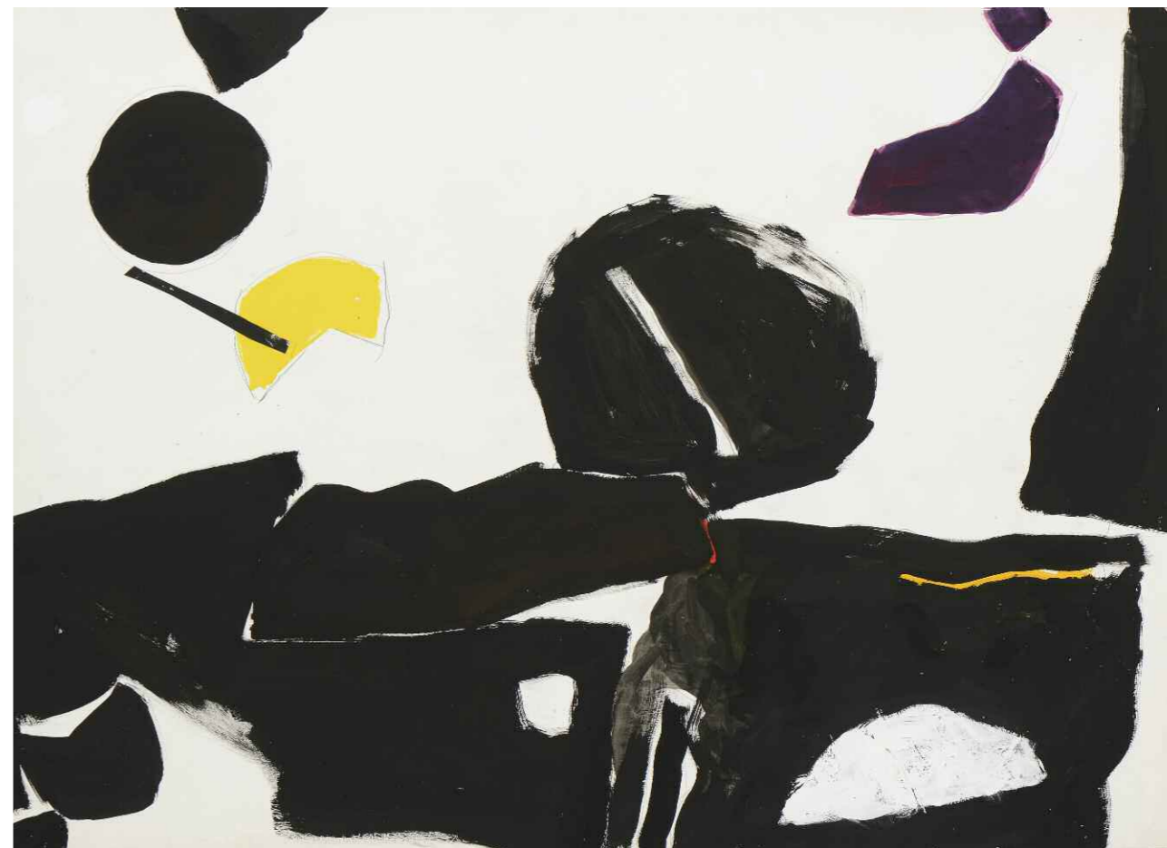
7 Sans titre, circa 1960 Gouache and collage on paper 75 x 108 cm / 29 x 42 in