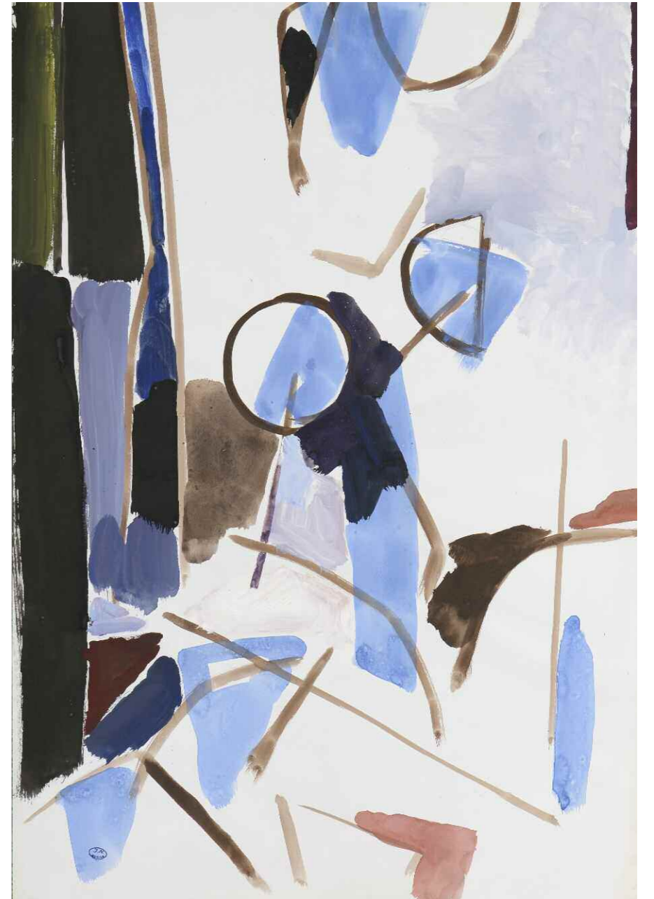
2 Sans titre, circa 1955/60 Gouache on paper 108 x 75 cm / 42 x 29 in