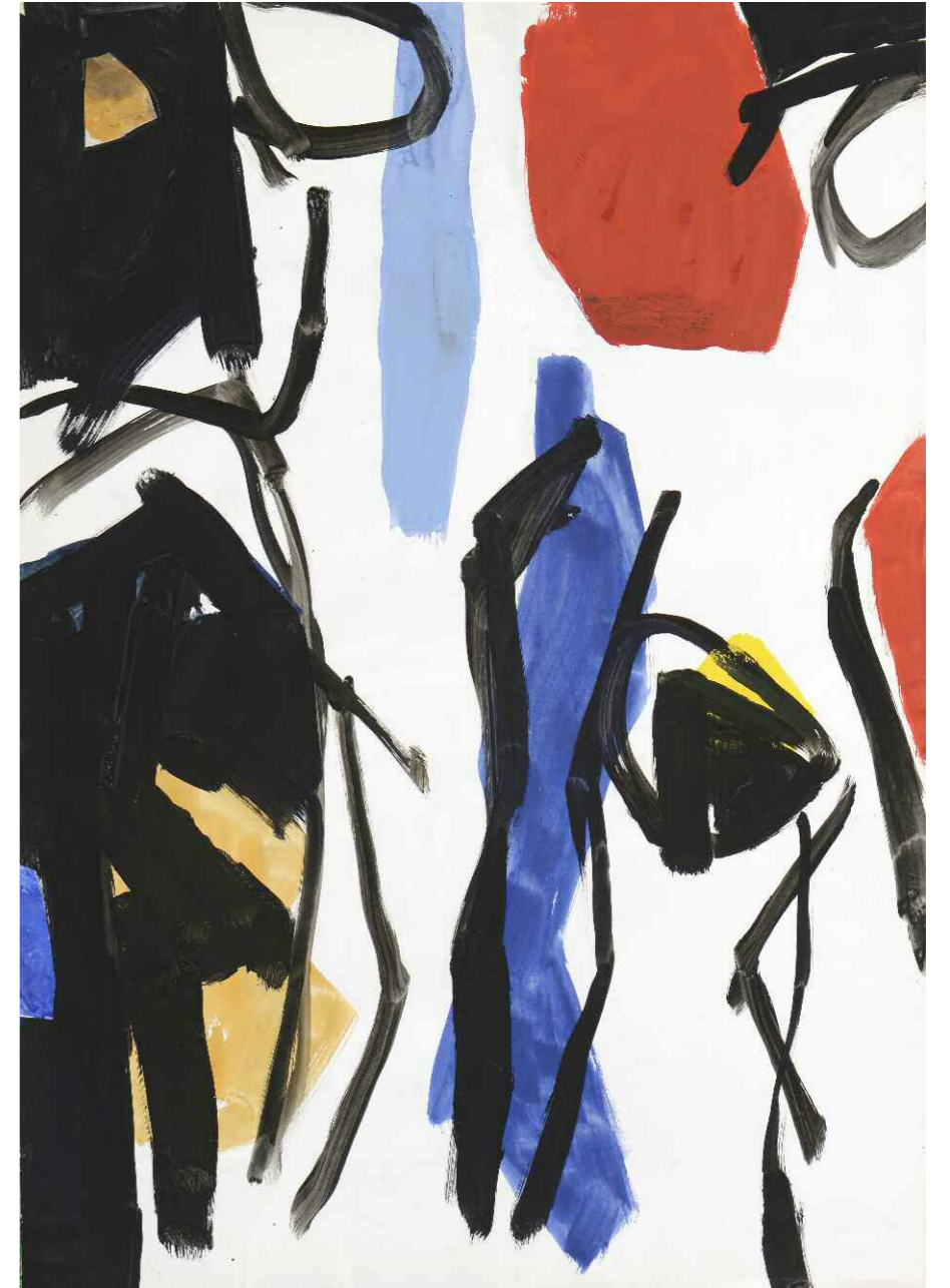
15 Sans titre, circa 1960 Gouache on paper 108 x 75 cm / 42 x 29 in