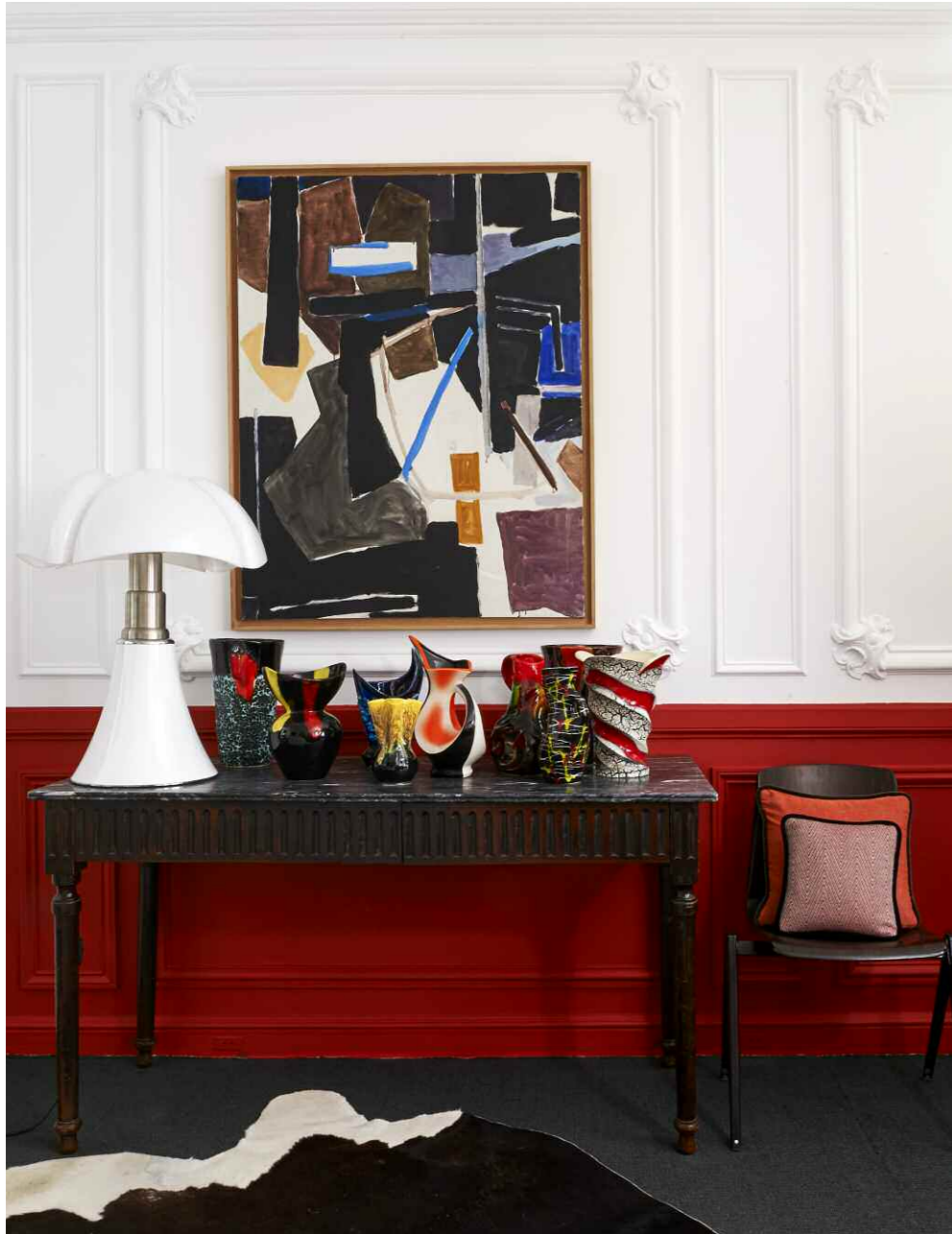
Catalogue no.3 (facing) at Maison Antoine d'Albiouse, Paris