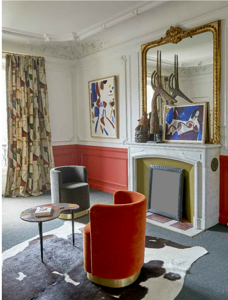
An installation of Nestlé's works at Maison Antoine d'Albousse, Paris, in 2018 Note catalogue numbers 14 and 17 displayed

During his time in Germany he had been employed as chief decorator at two department stores, and he continued this work in Paris, including working on the Exposition Internationale des Arts et Techniques dans la Vie Moderne in Paris in 1937. However, Nestlé always identified himself as a painter. In Paris immediately after the war he painted a series of works inspired by the rebuilding of the city, with cranes and machinery intertwined with men at work, but he also repeatedly drew the female nude, seeking like Matisse the perfect curve.