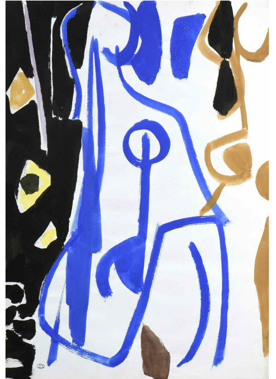
18 Sans titre, circa 1960-65 Gouache on paper 108 x 75 cm / 42 x 29 in