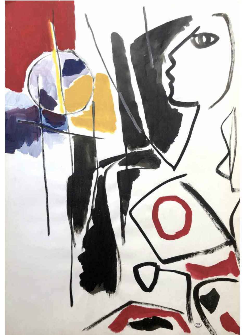
21 Sans titre, circa 1960 Gouache on paper 108 x 75 cm / 42 x 29 in