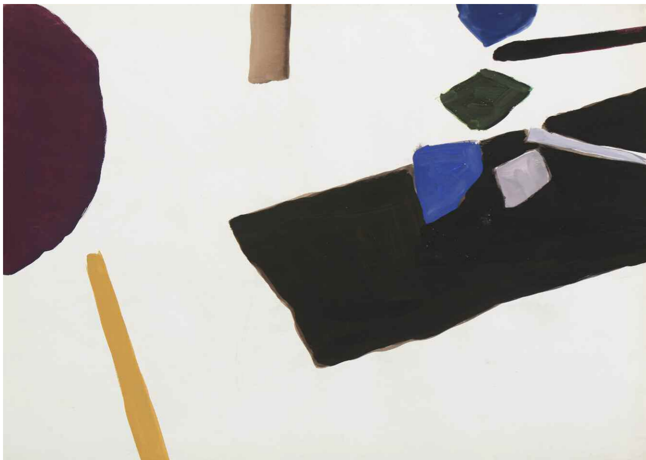
6 Sans titre, circa 1960 Gouache on paper 75 x 108 cm / 29 x 42 in