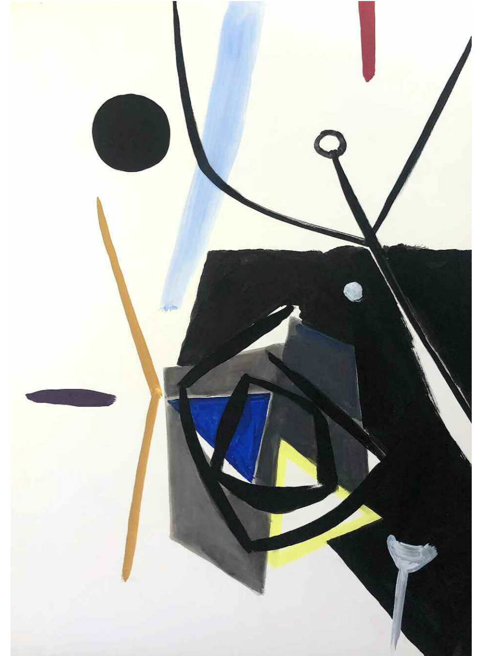
13 Sans titre, circa 1960 Gouache on paper 108 x 75 cm / 42 x 29 in