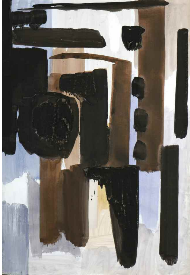
8 Sans titre, circa 1960 Gouache on paper 108 x 75 cm / 42 x 29 in