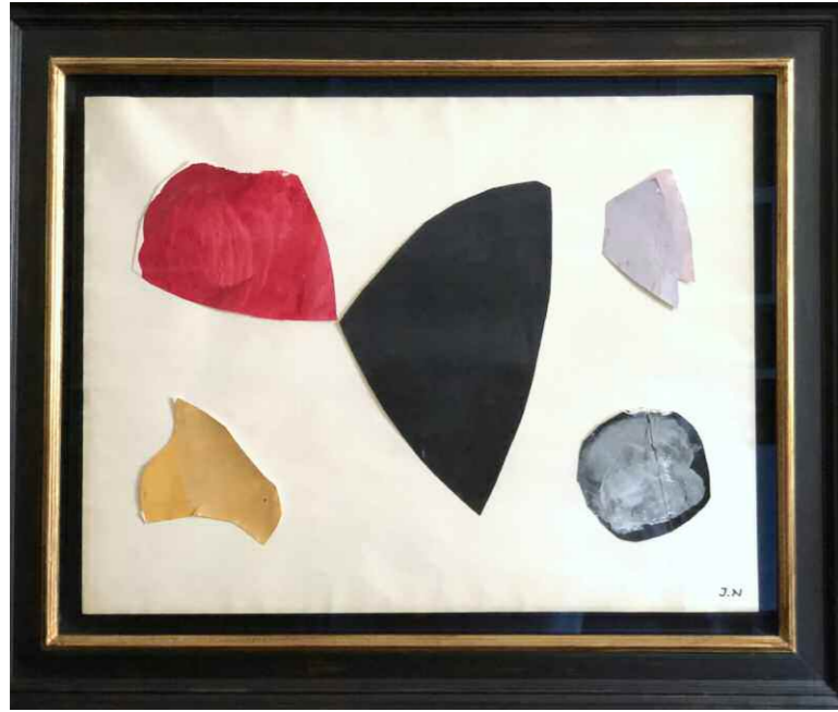
11 Sans titre, circa 1955 Gouache and collage on paper 50 x 65 cm / 20 x 25.5 in