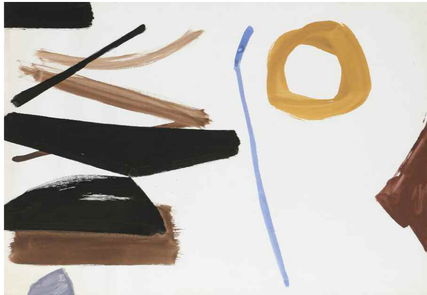
12 Sans titre, circa 1960 Gouache on paper 75 x 108 cm / 29 x 42 in