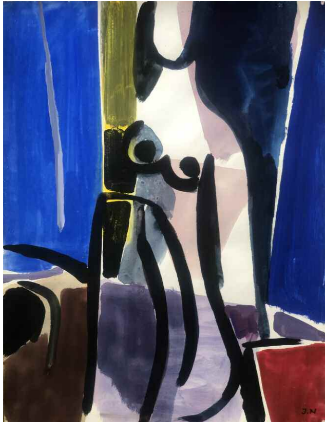
19 Sans titre, circa 1970 Gouache on paper 65 x 50 cm / 25.5 x 20 in