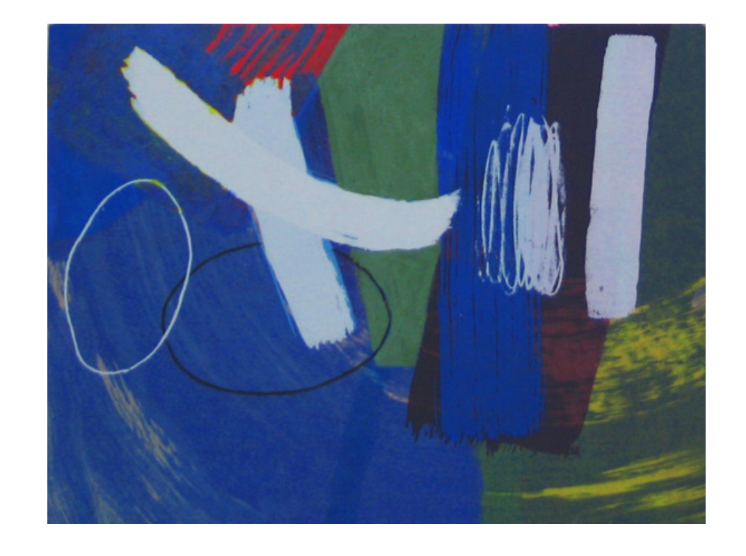
Millennium Series No.16

Painted in 2000 Screen Print and Mixed Media / 24 x 31 cm Signed & dated The artwork is recorded in the Barns-Graham Trust archive under number BGT6068