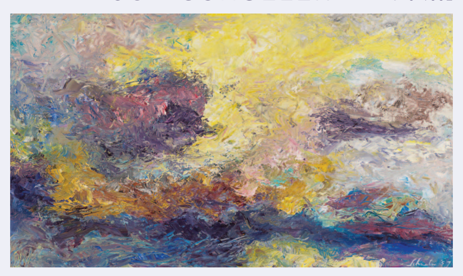
COMING UP FOR AIR & REFLECTIONS ON THE SOUND OF SLEAT